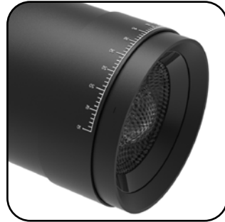
Beam Focusing Option (10°~60°)