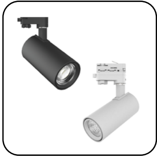
Standard & Integrated Driver