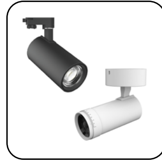
Mounting & Colour Options